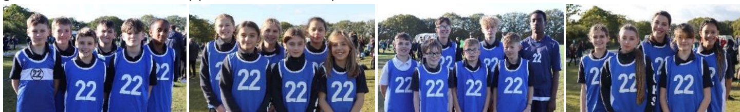
Pictured above are the CCHS Year 7 boys and girls (left), along with the Under 14 (right) and Under 16 teams (below)

Last week, our CCHS Cross-Country team travelled to the new Colchester Northern Gateway sports ground, for this year's annual District Cross-Country Championships. After a number of years when the runners have had to contend with wind and rain, this year the conditions were favourable. The going was still a little soft after the weeks of rain but the saturated ground did not cause too many problems for the competitors.